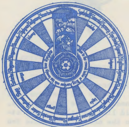
King Arthur's Round Table

THE PHILOSOPHICAL RESEARCH SOCIETY, INC. 3910 LOS FELIZ BOULEVARD LOS ANGELES 27, CALIFORNIA