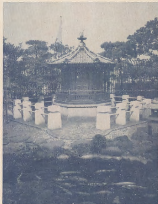
SHRINE ON ROOF OF TAKASHIMAYA DEPARTMENT STORE

IF YOU HAVE NOT ALREADY secured a copy of BUDDHISM AND PSYCHOTHERAPY , we feel sure that you will enjoy this book and find it most inspiring and therapeutic in these days of confusion and tension. One purchaser wrote: "Your book, Buddhism and Psychotherapy , is a true revelation, and is written with such beautiful meaning and feeling that I found it difficult to put down. It will always have a very special, significant meaning to me."