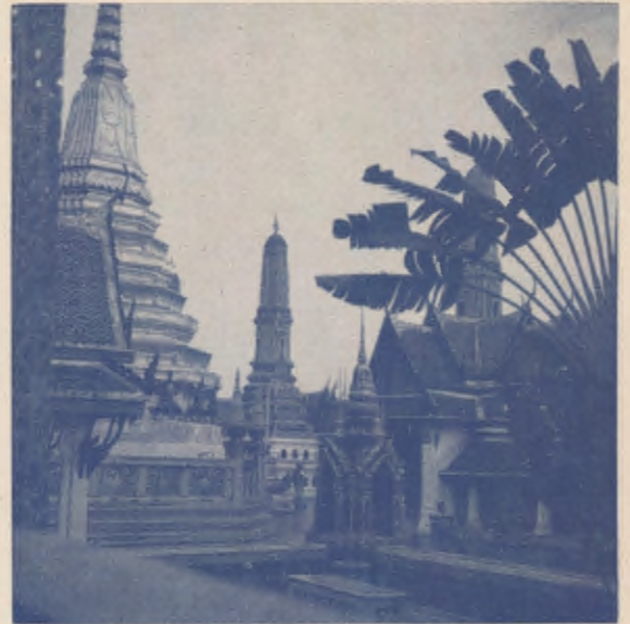
BUDDHIST MONUMENTS IN THAILAND

We believe that our quarterly magazine is a unique publication, and that each issue contains unusual material of interest to almost everyone. Every issue of our Journal is full of surprises. Consider, for a moment, some of the informative editorials, articles, and essays which will come to you in the course of the next four issues.